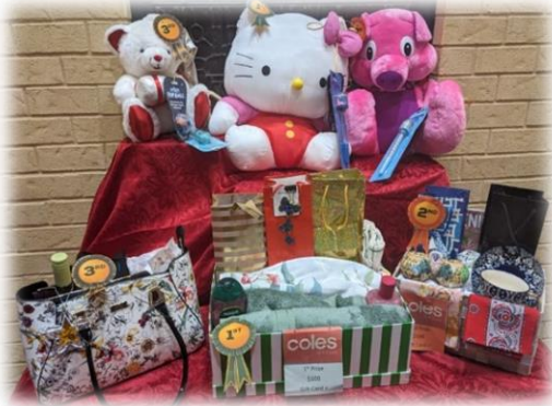
Applecross – Raffle - lone serving at Seniors Lunch