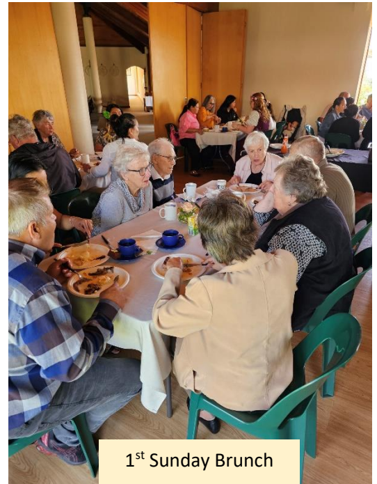
1 st Sunday Brunch