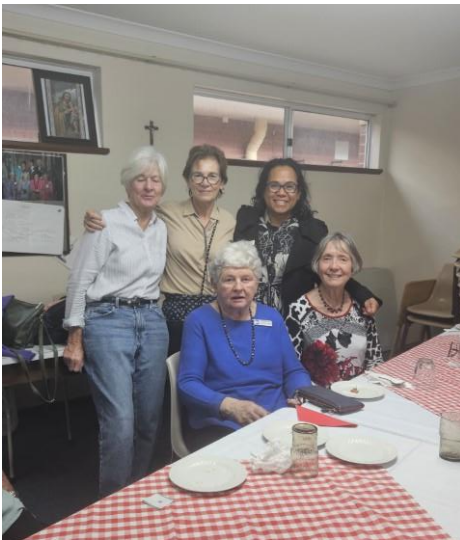
At Busselton WUCWO Day