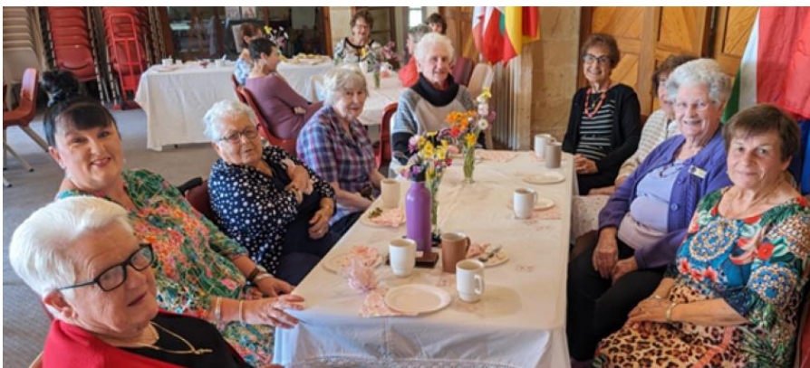
Left- Guests at Devonshire Tea