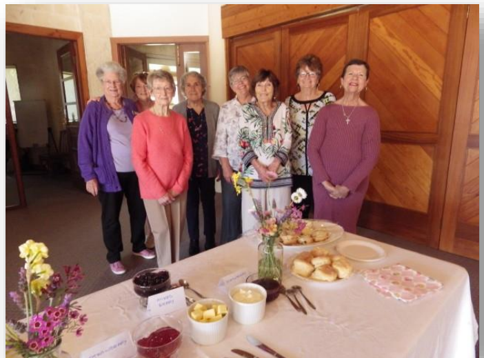
Above – Members ready to serve