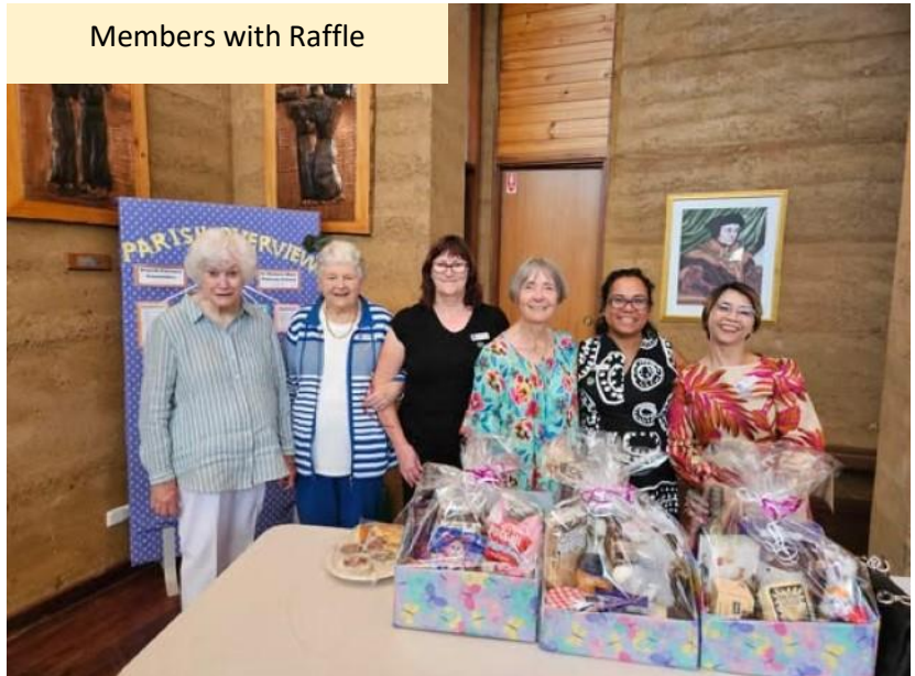
Members with Raffle